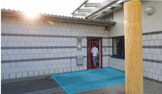
The "Intrusion Detection" analytic triggers an alarm when a person enters the restricted area.

6MP dome with intelligent video and IR, for indoor and outdoor applications